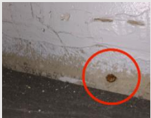
Rust & Efflorescence