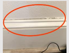
Buckling & Separating