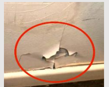
Cracking & Peeling